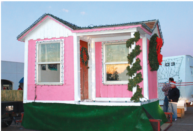
Miracles Parade Float

All of us at Tree Loving Care want to wish you and yours a very Merry Christmas and a Happy New Year. The Christmas light season has been fun. I hope that all of you that can, still come by and see our animated light display in person. It is located just west of Wolfforth on US 62. You can sit in the comfort of your car, tune into our FM signal and watch the lights being directed by the music. You can also click on the link and feel free