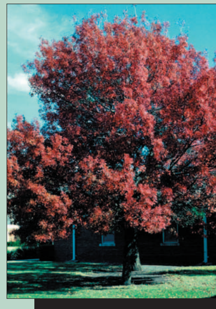
Chisos Red Oak

Ask your favorite nurseryman for this tree. They won't carry new trees unless you ask for them.