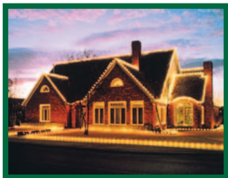
Home 'Lighted Up for the Holidays'

Christmas Décor by Tree Loving Care is a new division of Tree Loving Care and has consumed so much of my time the last 3 months that I've had little time to reflect on the events of the last year. What an exciting time it has been.