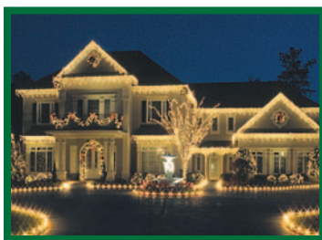
Home 'Lighted Up for the Holidays'